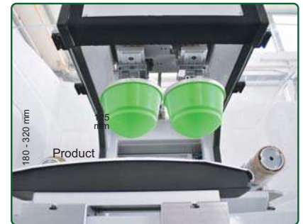
Maximum space for product/image with advantage of auto pad clean function