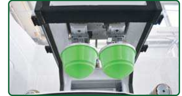
2 independent pad cylinders