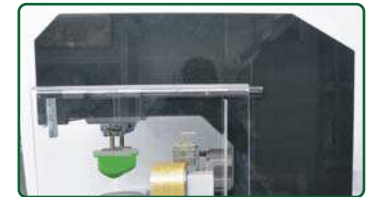
Stable granite stone machine structure