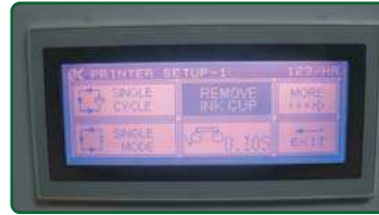
PLC control touch screen panel