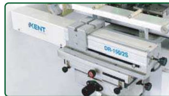
2 color pneumatic shuttle