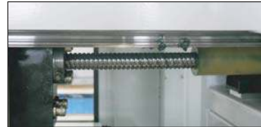
- Linear guide rail