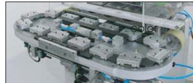
- Digital shuttle for multi-