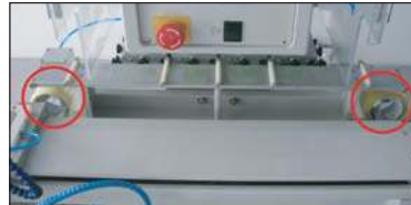
- Auto pad clean