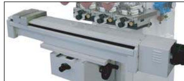
- Digital shuttle for multi-color