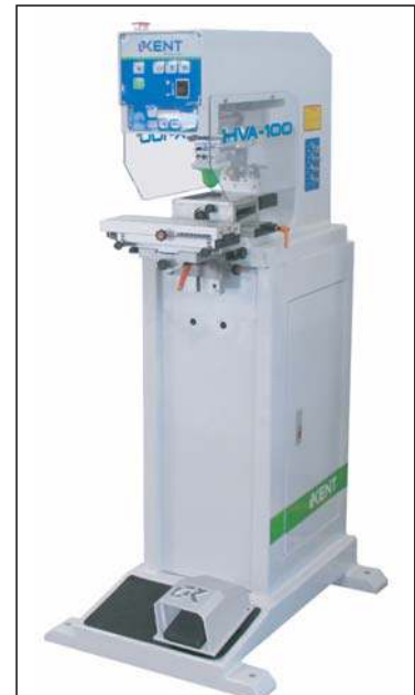
Newly Improved MS-100 machine stand enhances stability