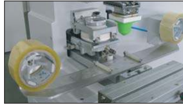
Auto pad clean