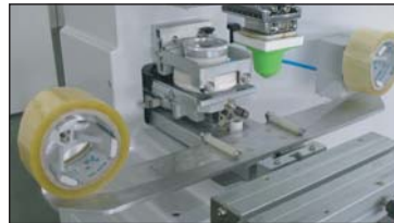
Auto pad clean