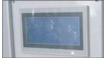
PLC control touch screen panel