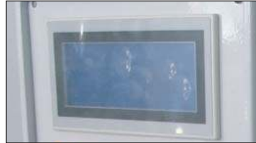
PLC control touch screen panel