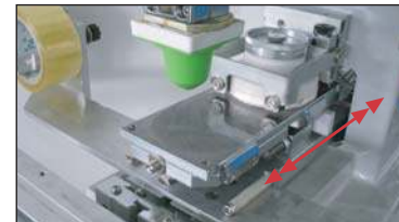
Platform in / out movement (Pad clean underneath)