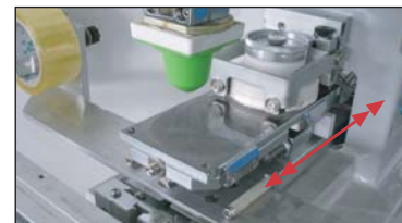
Platform in / out movement (Pad clean underneath)