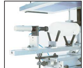
- Air inflation unit