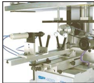
- Registration unit