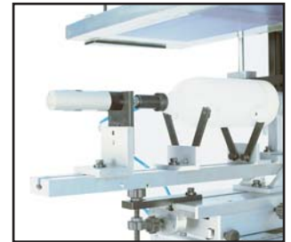
- Air inflation unit