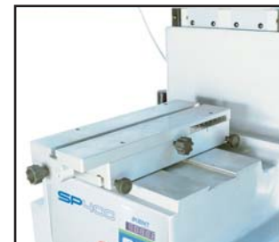
- Work table