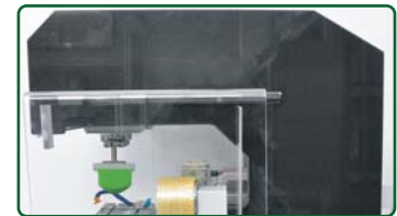
Stable granite stone machine structure