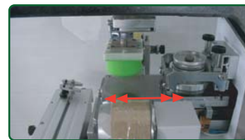
Platform in / out movement & pad clean underneath design for max. product size