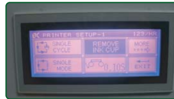
PLC control touch screen panel