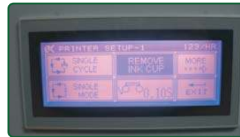
PLC control touch screen panel