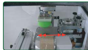
Platform in / out movement & pad clean underneath design for max. product size