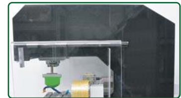
Stable granite stone machine structure