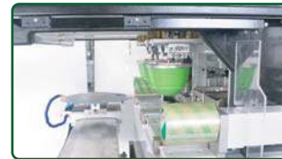
Turbo pad clean feature