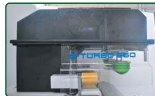
Stable granite stone machine structure