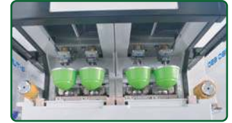
4 Independent pad cylinders