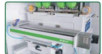
Precision servo product shuttle (DRE)