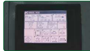
Large touch screen panel