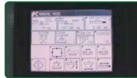
Large touch screen panel