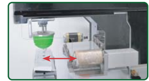
Pad in/out stroke for max. throat depth