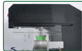
Stable granite stone machine structure