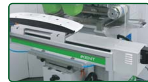
Precision servo product shuttle (DRE)