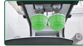
2 Independent pad cylinders