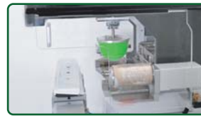
Turbo pad clean feature