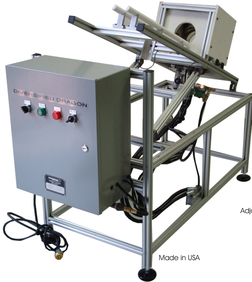
Made in USA