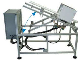
Adjustable angle for drop through speed control