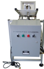
MiXer Controls and safety Interlock