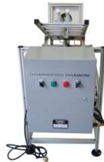
MiXer Controls and safety Interlock