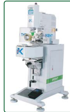
2-station pneumatic Turntable