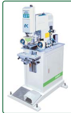
Stand alone with pad cleaning