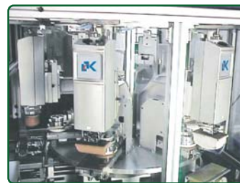
6 or 8 Aliens on an indexing table