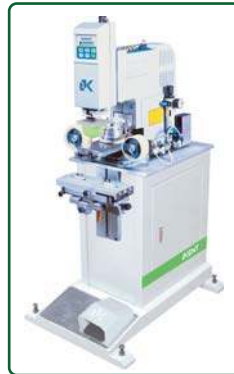
Stand alone with pad cleaning