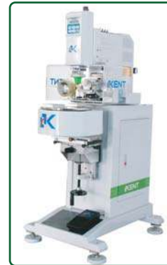
2-station pneumatic Turntable