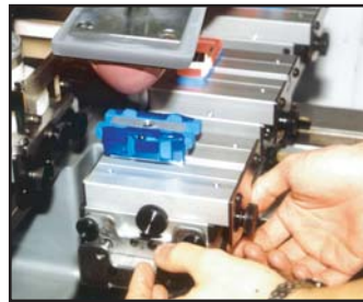
2 individual X,Y angle platform/work table with independent adjustment