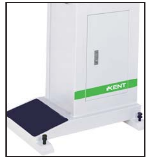
Machine stand (MS-100)