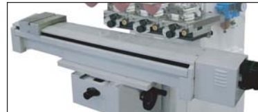
- Digital shuttle for multi-color