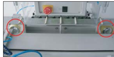
- Auto pad clean