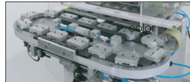
- Digital shuttle for multi-