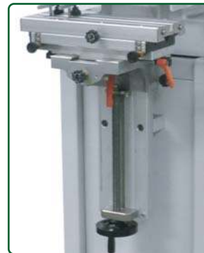
User-friendly: Steering up/down work table