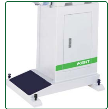
Newly improved MS-100 machine stand enhances stability