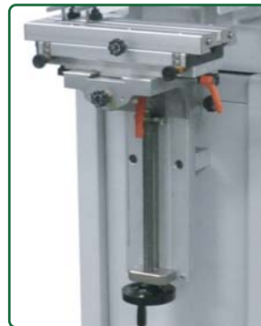
User-friendly: Steering up/down work table