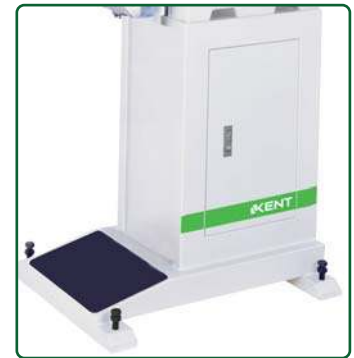
Newly improved MS-100 machine stand enhances stability